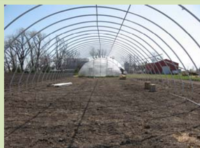
New Greenhouse in Progress

The weather has been great, we are more confident that we can handle heavy amounts of rain with our field tile.