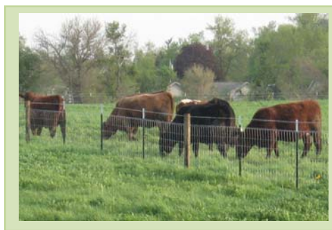
The cows are back on pasture! They, like us, are very occupied by the fresh spring greens

Boil the potatoes. When done, mash with the butter, milk, and chopped garlic chives. Salt and pepper to taste.