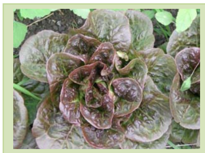
Red Romaine Lettuce - Yum!

What a change a few days brings. We had frost on Saturday night that nipped the asparagus; we had to cull quite a bit in the field. Today it was in the mid-80s.