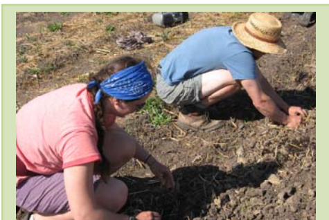
Scattergood Friends School helping us transplant onions

Grease 9x9" glass baking dish. Mix first three ingredients and place in baking dish. Mix next four ingredients and pour over rhubarb mixture. Will be crumbly. Sprinkle with cinnamon and bake at 350 degrees for 35-45 minutes or until bubbly around the edges.